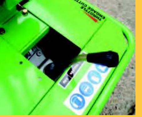
Forward & Reverse Gearbox